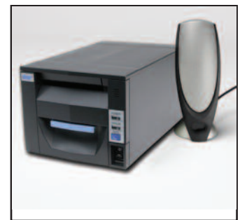
User Communication Tool