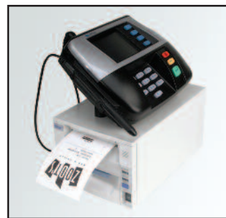
Space Enabling Design