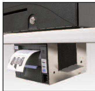
For Limited Counter Space